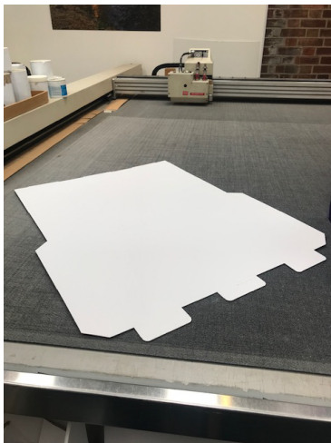
4: Flat shelf