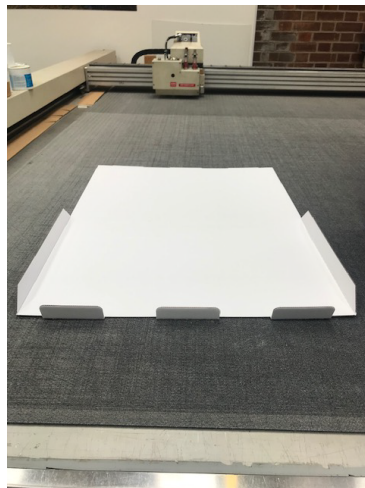
5: Fold up tabs