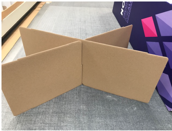
14: Slot pieces together