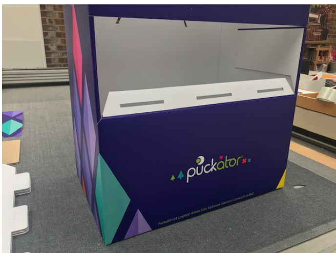
8: Insert shelf tabs to the corresponding slots on the main body