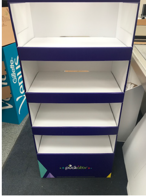
11: Lock large shelf tab into slot in main body.