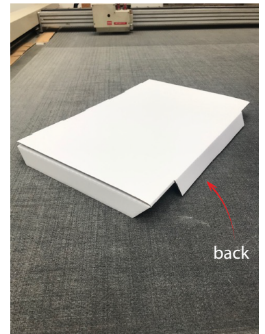
7: Ensure tabs are facing down