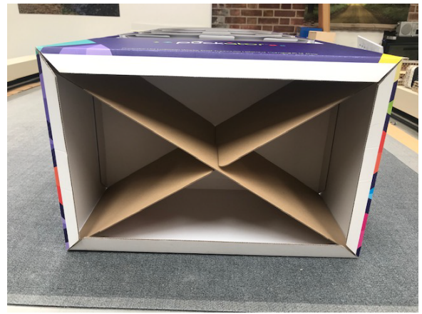
15: Insert X frame into base