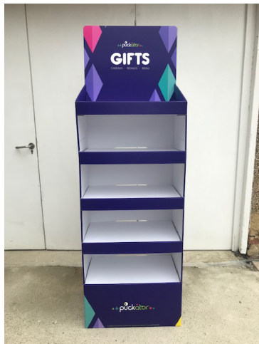
17: Complete unit