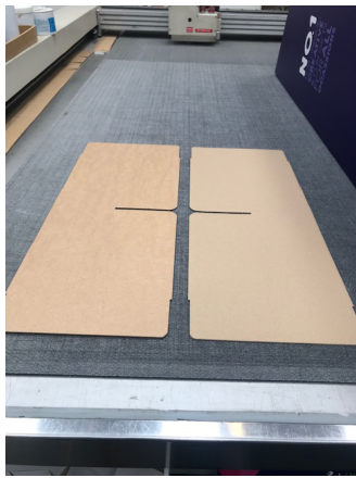
13: X frame strengthener