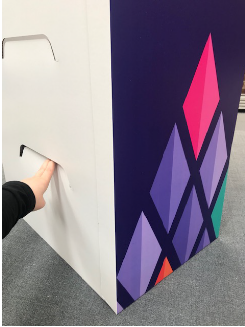
10: Push in tabs on rear of main body