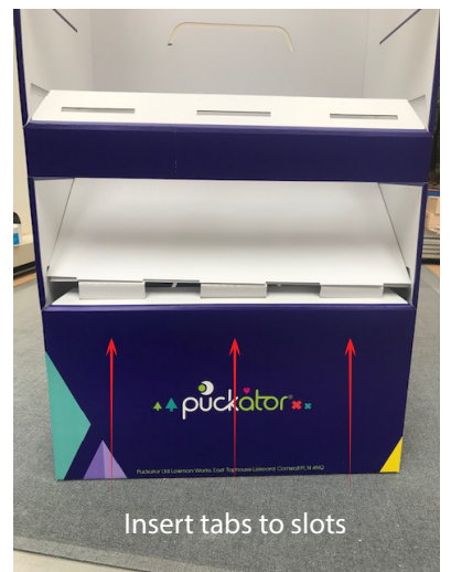
10: Insert three front tabs into locator slots and push down firmly to lock in position