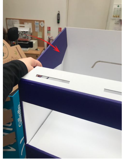
12: Fold down top sides for strength then add top shelf.