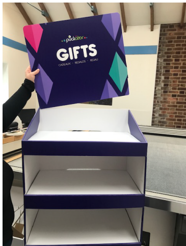
16: Insert header