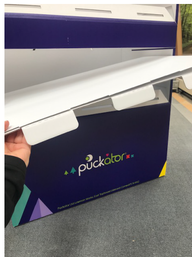
9: Insert Shelf