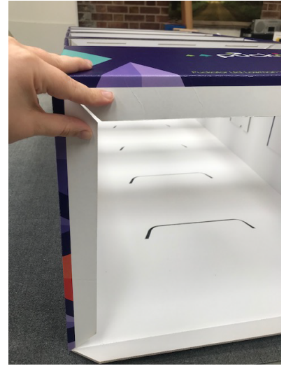
3: Fold in corners on the base of the main display